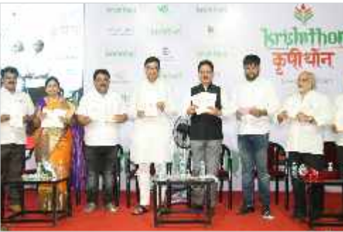
Hon. Shri. Balashaheb Thorat - Revenue Minister Hon. Shri. Girish Mahajan - Former Guardian Minister