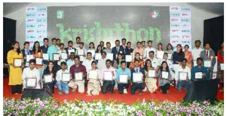
Youth in Agriculture - Summit & Awards in Krishithon 2019