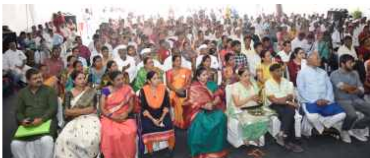
Women in Agriculture - Summit & Awards in Krishithon 2019

Media House has launched a multilingual periodical AGRI TRADE MEDIA for the benefit of the agro-industries, agro-dealers and farmers in general. This initiative has gone a long way in fortifying the connect between all the stakeholders in the field of agriculture. As a result, in a record time the circulation of ATM has soared to phenomenal heights.