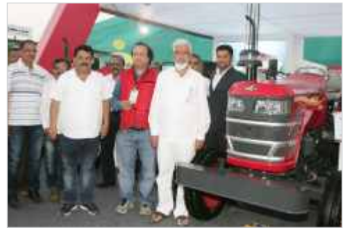
Hon. Shri. Dadaji Bhuse Agriculture Minister, GOM