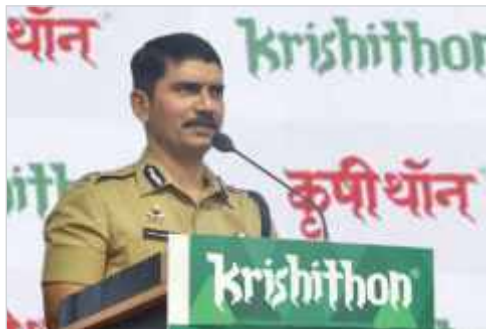
Shri Vishwas Nangare Patil , IPS at Youth In Agriculture Summit