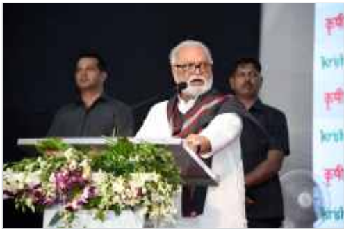
Hon. Shri. Chhagan Bhujbal Minister of Consumer Affairs, GOM & Guardian Minister, Nashik