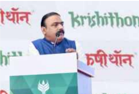
Shri Makarnad Anaspure Actor and Social Activist