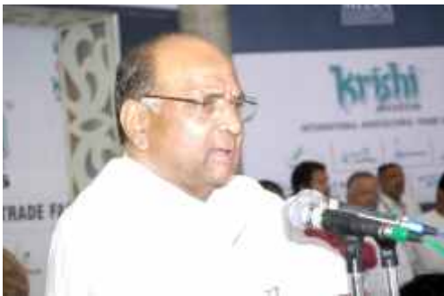
Hon. Shri. Sharadrao Pawar Former Union Minister for Agriculture