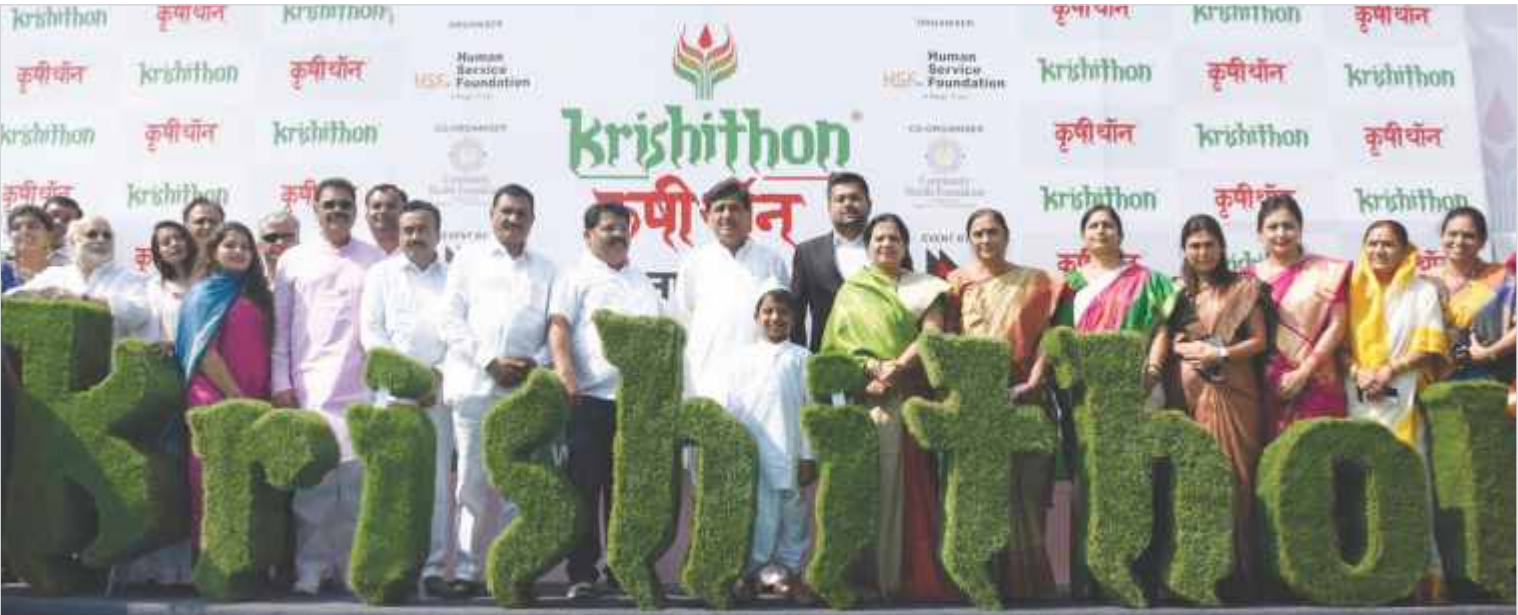
Hon. Shri. Ashokrao Chavan - PWD Minister of Maharashtra @ KRISHITHON