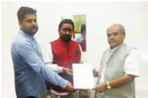
Hon. Shri. Narendra Singh Tomar Union Minister for Agriculture and Farmers Welfare