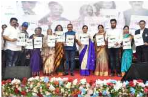
Agri Trade Media launched in the presence of eminent guests