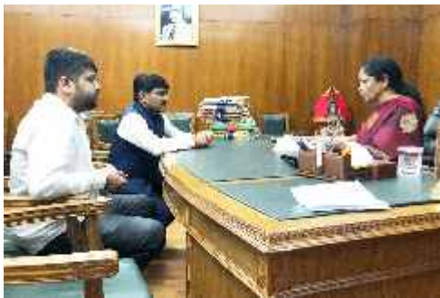
Hon. Smt. Nirmala Sitharaman - Union Minister for Finance Shri Hemant Godse – MP, Nashik